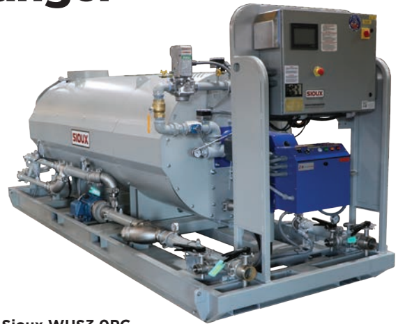
Sioux WHS3.0PG • 3,000,000 BTU/HR with Stainless Steel Heat Exchanger

For applications that cannot utilize the standard carbon steel models, Sioux offers water heaters with Schedule 40 stainless-steel heat exchanger and non-ferrous, wetted parts. All Sioux stainless steel heat exchangers are manufactured in house. These water heaters provide the same performance and features for specific applications that require stainless steel.