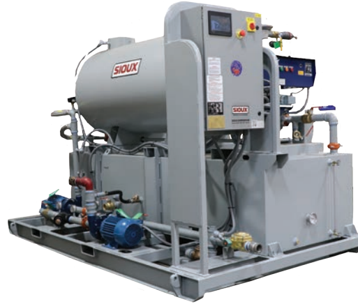
Sioux WHC1.7PG-T • 1,700,000 BTU/HR with 365 gallon tank

If you need an integrated water tank, Sioux offers NextGen™ water heaters with 1.0 or 1.7 Million BTU/Hr output and included water tank. These turn-key water heaters come ready to use. Connect the inlet and outlet water, plus utilities, and you are ready to make hot water.