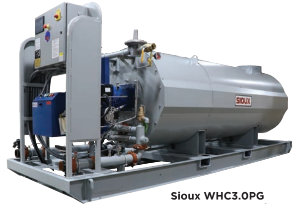
Sioux WHC3.0PG • 3,000,000 BTU/HR

Sioux water heaters are used worldwide in a variety of industrial applications. Sioux's NextGen™ water heaters come with advanced features to make the process of heating water safe, quick, and efficient. These horizontal heat exchanger units provide a continuous supply of hot water within minutes of startup with an efficient and simple design.