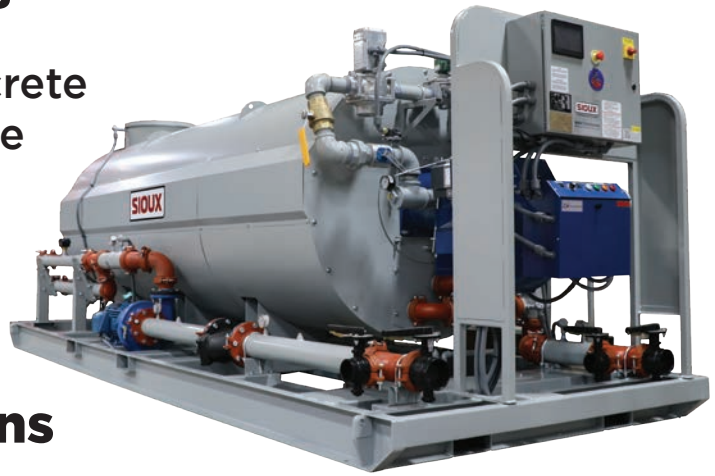
Sioux WHC5.0PG • 5,000,000 BTU/HR